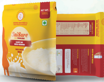
SAISURE FOR TODDLERS