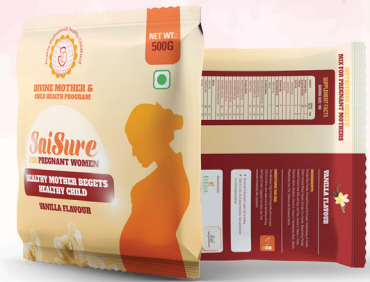
SAISURE FOR PREGNANT WOMEN