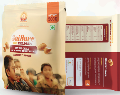
SAISURE FOR CHILDREN